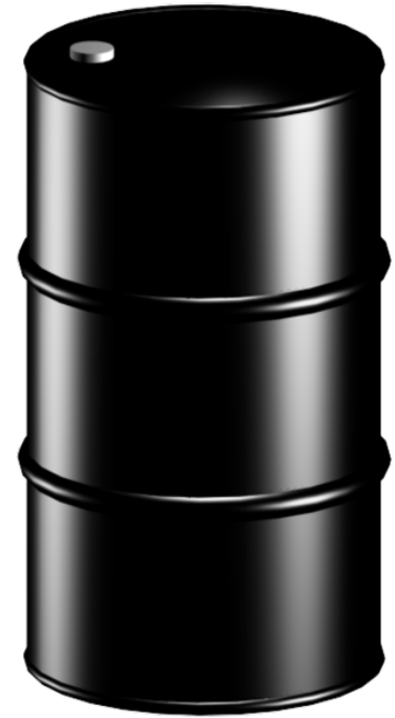
US Oil Shale Resource