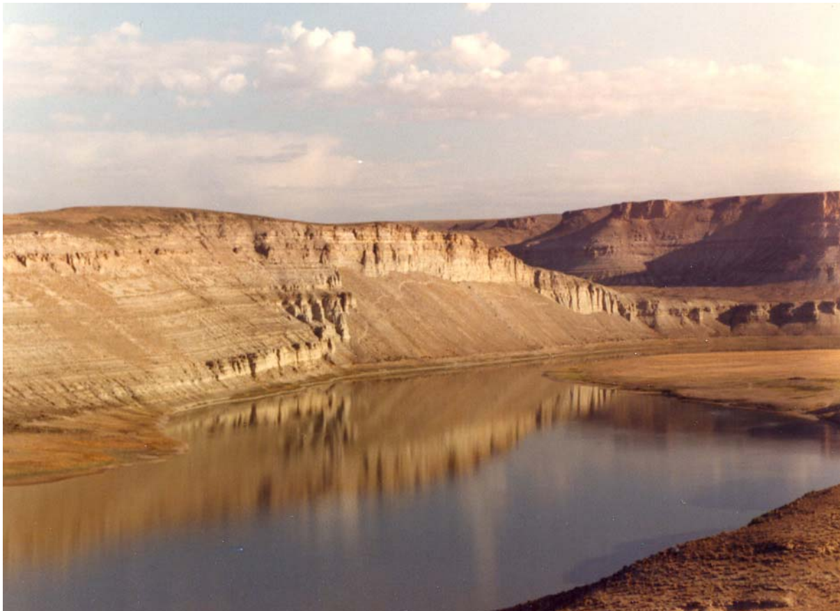
Figure 1: The Green River Formation along Flaming Gorge Reservoir, as it appears today, near the location of the Black's Fork Core Hole No. 1.

Samples for this work came from the U. S. Energy Research and Development Administration/ Laramie Energy Research Center, Black's Fork Core Hole No.1, located in the SE1/4 of the NE1/4 of sec. 24, T16 N, R 108 W, Sweetwater County, Wyoming drilled in 1976. Individual samples for study were selected based on lithology, mineralogy, and availability. The Black's Fork Core Hole No. 1 was cored from a depth of 181.0 to bottom of hole at 1676.6 feet with the borehole terminating in the Wasatch Formation. Figure 2 illustrates the areal extent of the Green River Formation in Wyoming and geographic location of the Blacks Fork Core Hole from which the samples of sediment containing the fossil